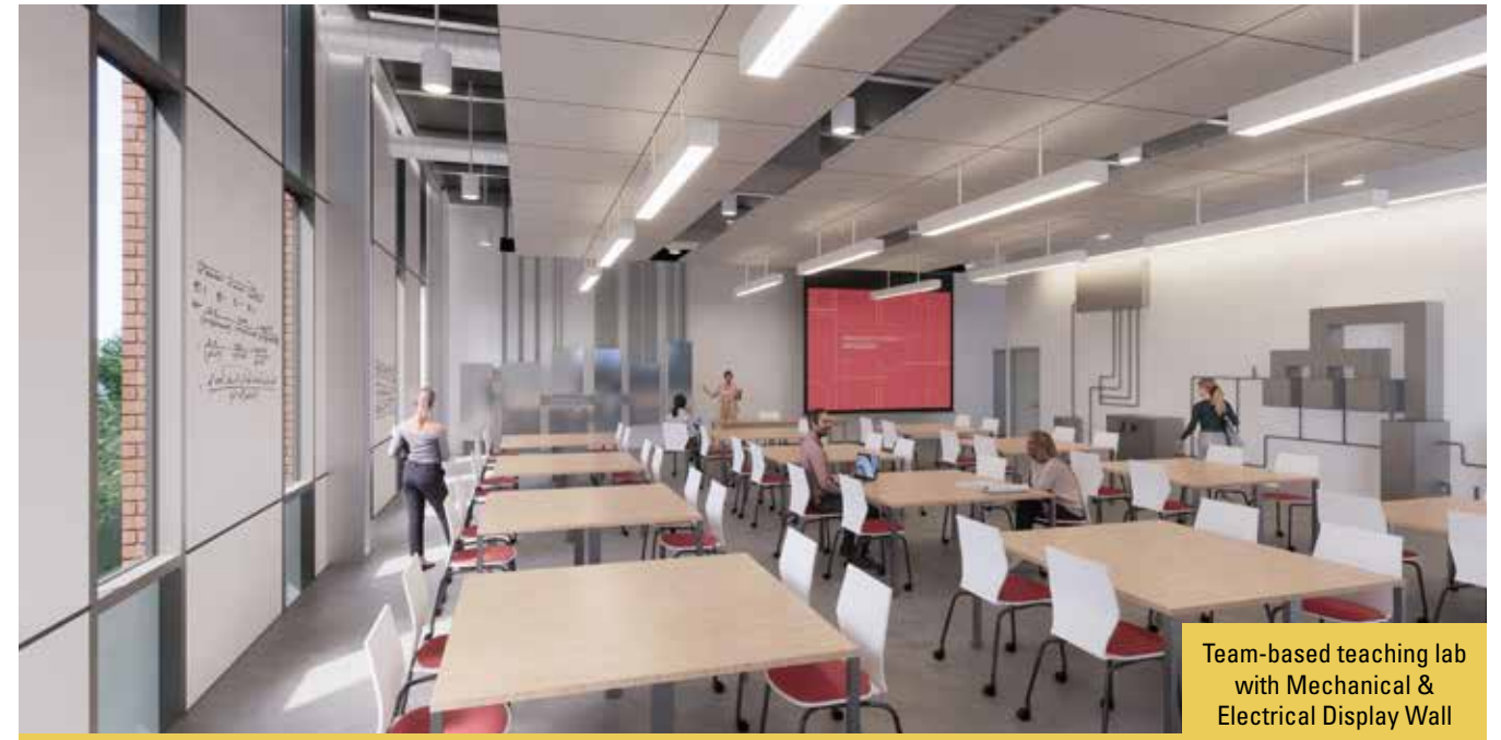
Team-based teaching lab with Mechanical & Electrical Display Wall

The plan features open, flexible instructional spaces and large collaboration areas that will allow students and faculty to engage in active learning and discussion. The overall design is meant to be inviting and inclusive, and will surround students in a dynamic living-learning environment and community.