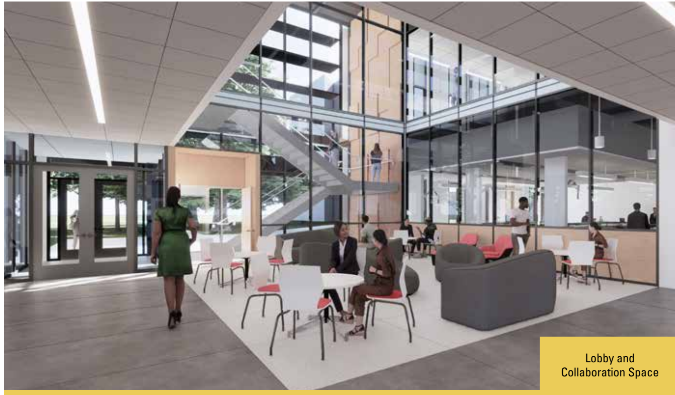
Lobby and Collaboration Space