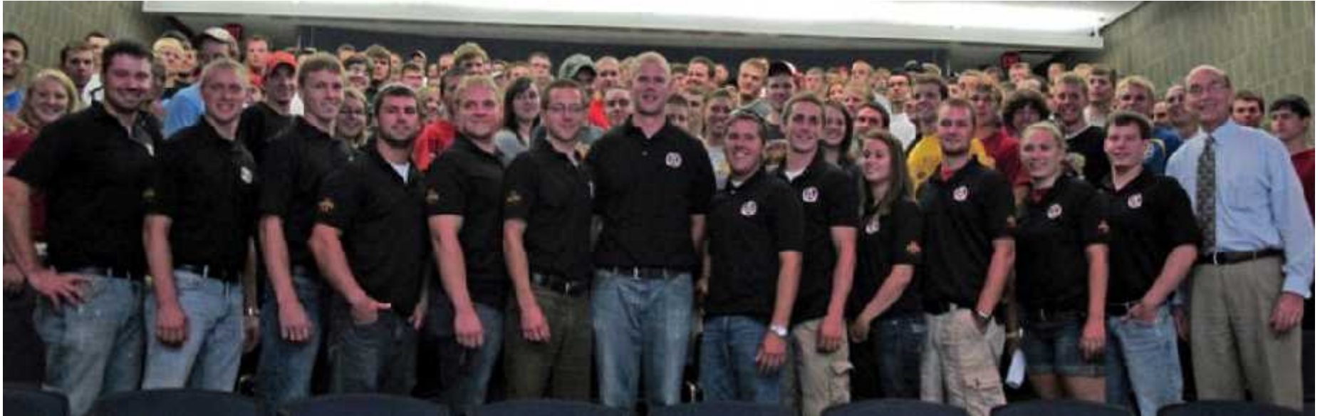
ISU AGC Student Chapter 2010-2011