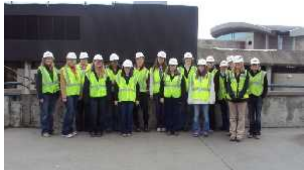
Figure 2 Mortenson visit