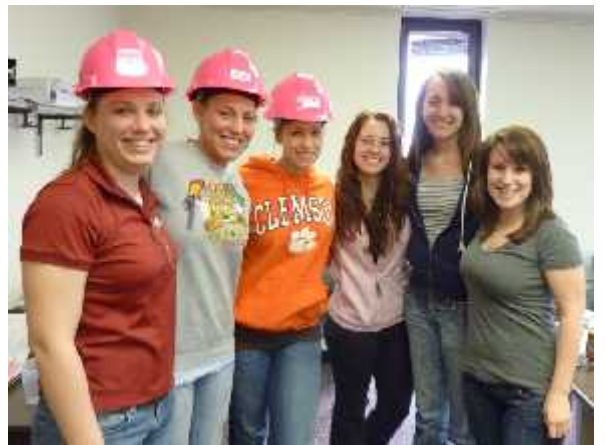
Figure 3 Graduating and returning ConE ladies