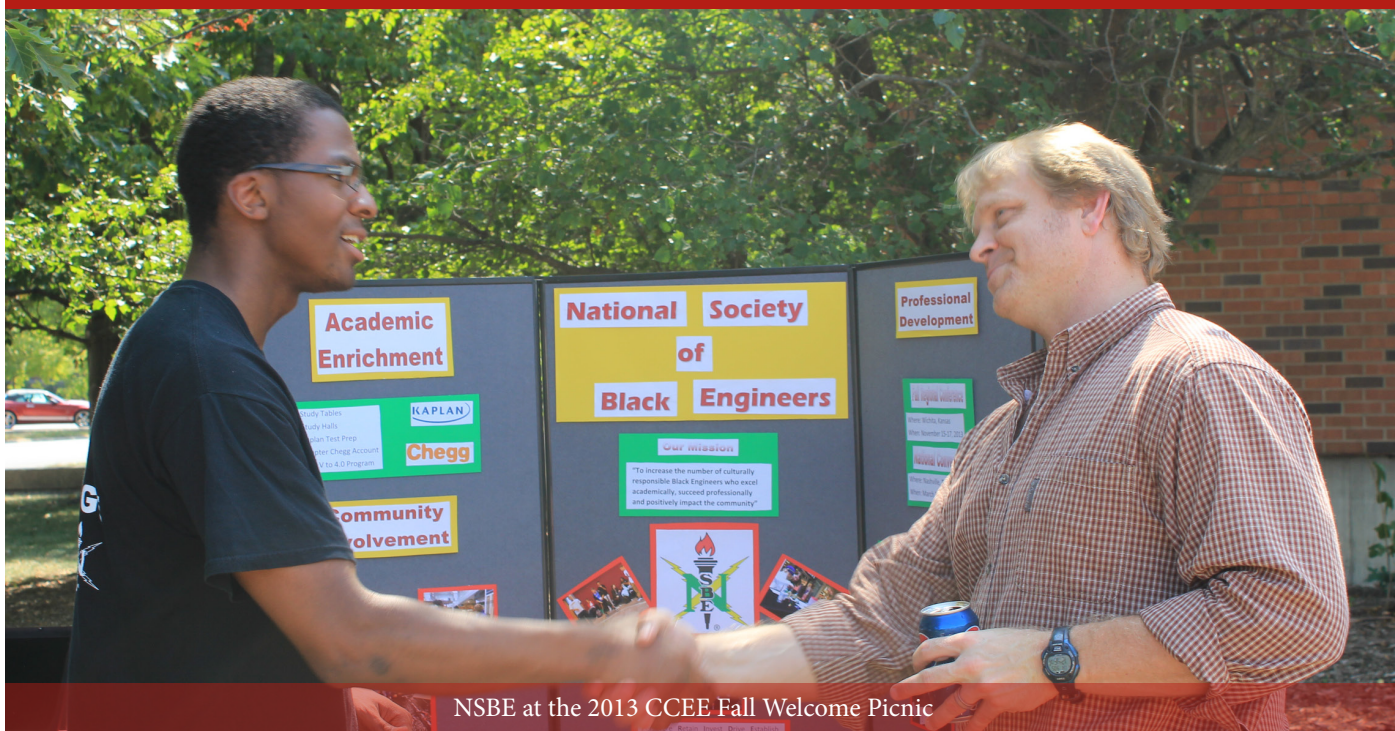
NSBE at the 2013 CCEE Fall Welcome Picnic

The National Society of Black Engineers (NSBE), one of the largest student run organizations in the U.S., is focused on increasing the number of culturally responsible black engineers who excel academically, succeed professionally and positively impact the community. This motto has since evolved to incorporate people of all races, color and creed, as well as all students in the science, technology, engineering, and mathematics (STEM) fields.