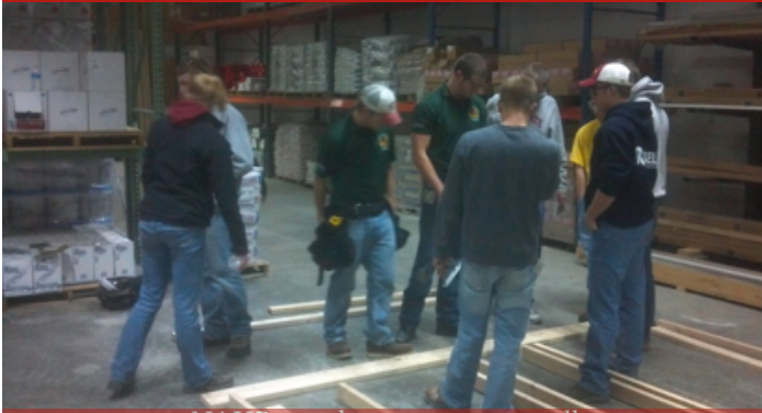
NAHB members construct a wall