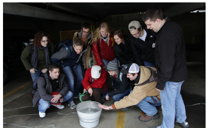
NECA team chose the Iowa State Memorial Union Parking Ramp as their 2013 energy retrofit project.

Iowa State, along with University of Washington and Pennsylvania State University, advances to the oral presentation portion of the competition, set to be held at the NECA Convention Oct. 12 in Washington, D.C. Results of the oral presentation and overall national winner will be announced Oct. 13.